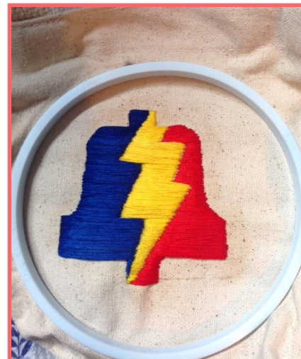
Samantha's very first embroidery project